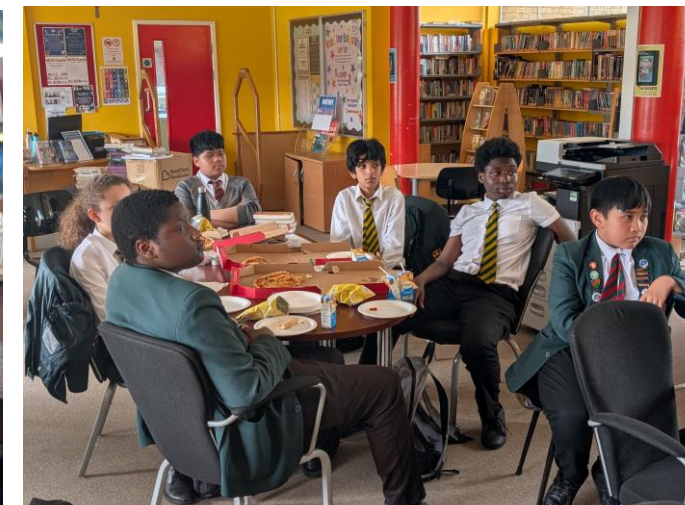
Carnegie Children's Book Awards Shadowing group