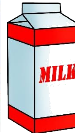
Long Life Milk