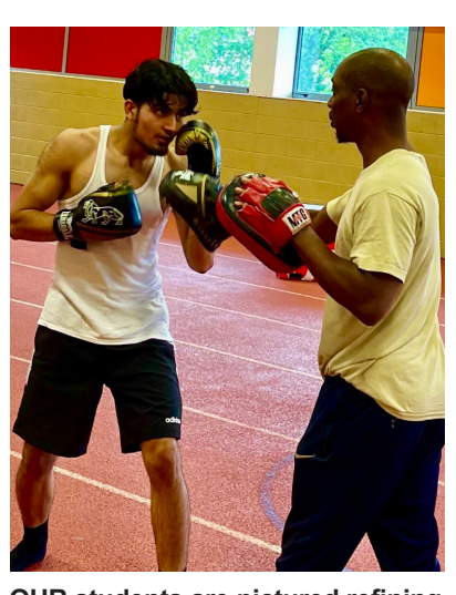
OUR students are pictured refining YEAR 8 students get in some YEAR 7 students showed off their boxing skills.