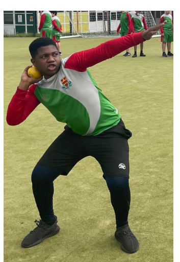
practice ahead of Sports Day. their cooking creations.