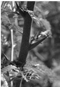
Cody Hinchliff 2004 - English Wikipedia

Movement makes the animals wary and so they move away.